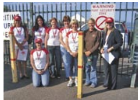
A team of volunteers, who have all completed the Tourism Certificate III, waits for passengers coming off the cruise ships at the Port of Eden.