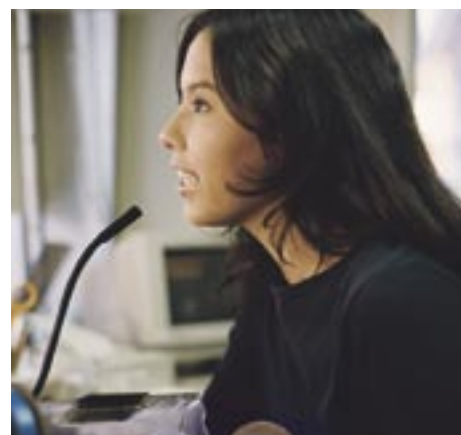
TAFE NSW tailored a one-day course to help staff deal with a sudden rise in customer complaints.