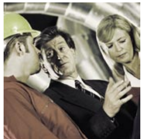
Project Management is increasingly recognised as a necessary skill in business.

TEL: (02) 1800 620 280 FAX: 1800 678 941